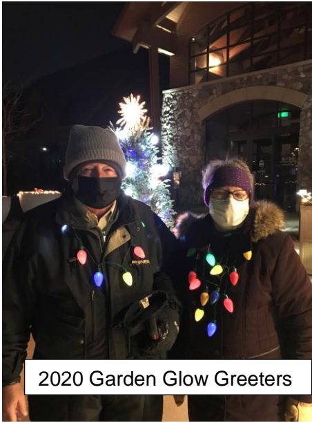
2020 Garden Glow Greeters