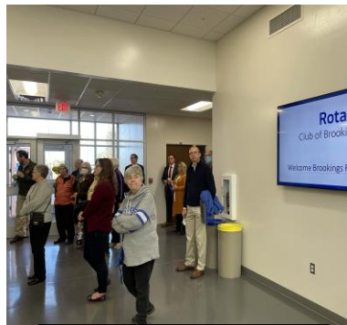
Tour of Precision Ag