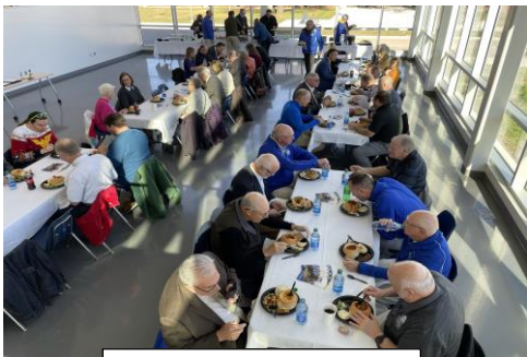
Meal at Precision Ag