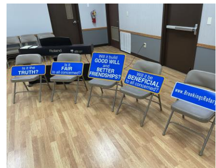
Signage of the 4-Way Test

In the past months Brookings Rotary has been involved in several successful volunteer activities. With continued enthusiasm Brookings Rotary intends to complete many more in the next year!