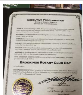
SD Governor's Proclamation Brookings Rotary Club Day Feb 1, 2020