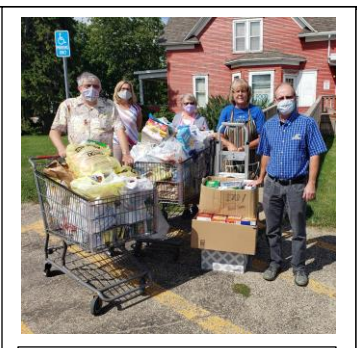
Food Drive Delivery