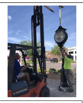
Rotary Clock Install