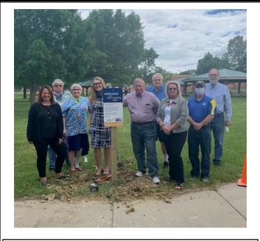
Born Learning Trail Install