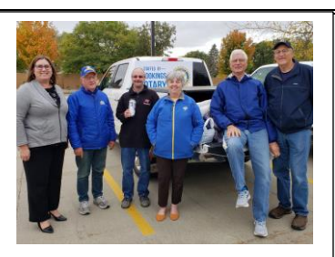
Rotary Coat Drive

In the past year Brookings Rotary has been involved in several successful volunteer activities. With continued enthusiasm Brookings Rotary intends to complete many more in the next year!