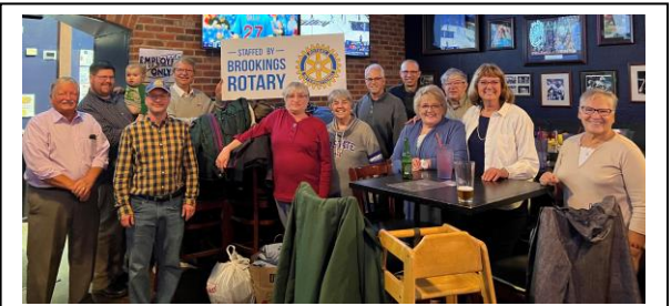
Brookings Rotary coat drive at a Thirsty Thursday at Cubbys

It was a very busy year for Brookings Rotary in 2022. Let's continue our efforts for 2023