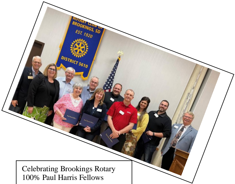
Celebrating Brookings Rotary 100% Paul Harris Fellows