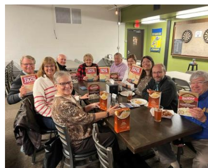
Thirsty Thursday potato drive

In the past months Brookings Rotary has been involved in several successful volunteer activities. With continued enthusiasm Brookings Rotary intends to complete many more in the next year!