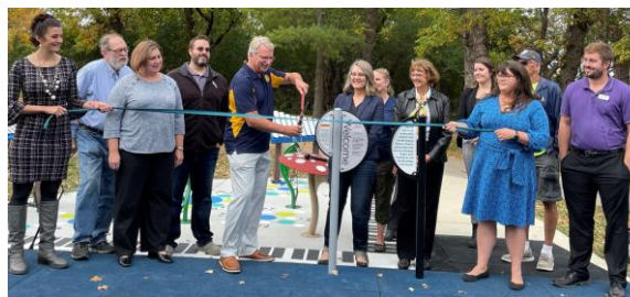
Music playground at Larson Park