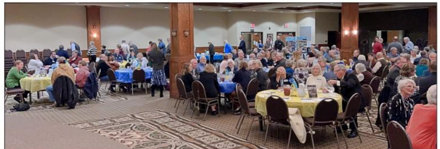
Top: More than 30 donated gourmet desserts were sold at the silent auction, garnering more than $3,200 for Ukrainian relief.