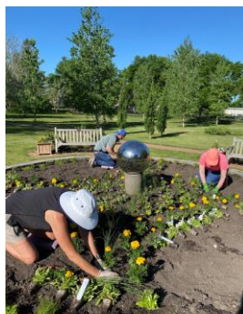
Planting the Garden